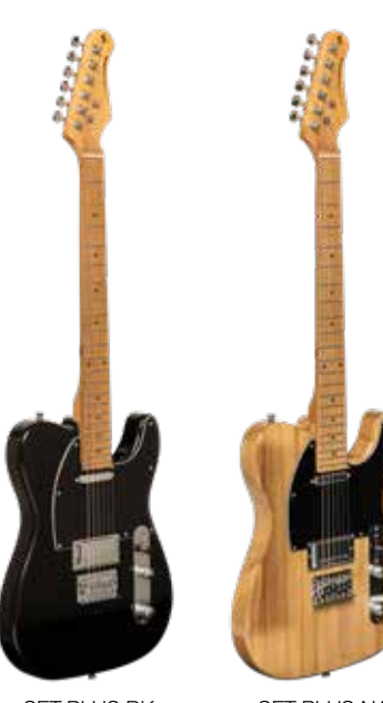
SET-PLUS BK SET-PLUS NAT