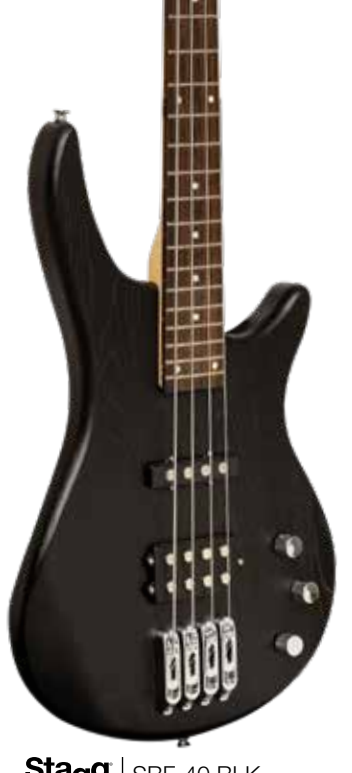
Stagg | SBF-40 BLK