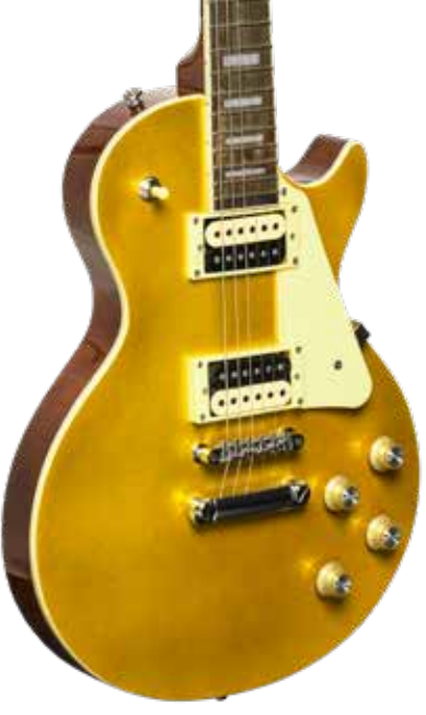
Stagg | SEL-STD GOLD