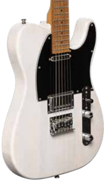
Stagg | SET-PLUS WHB