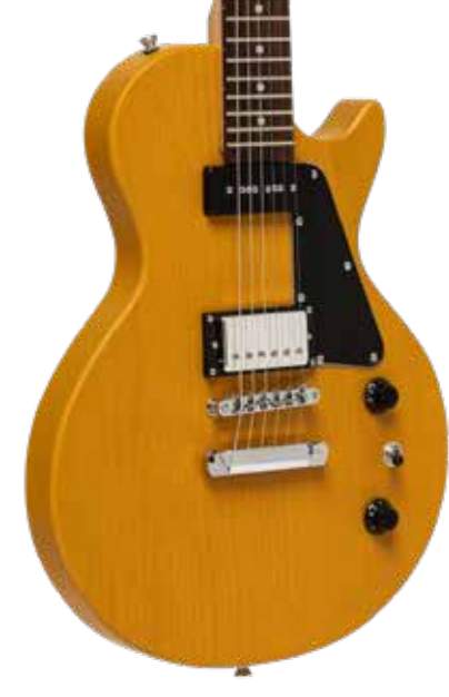
Stagg | SEL-HB90 VYL