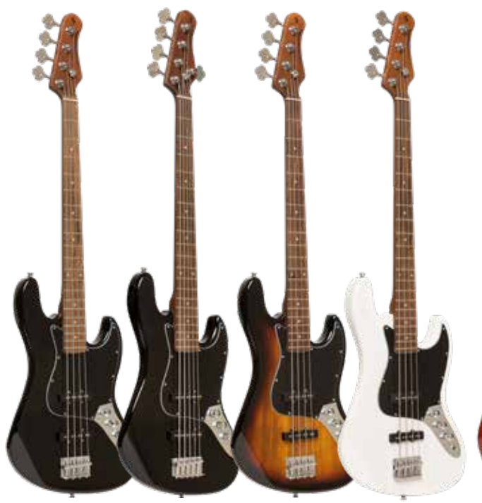
SBJ-30 BLK SBJ-30 BLK 5S SBJ-30 SNB SBJ-30 WHB