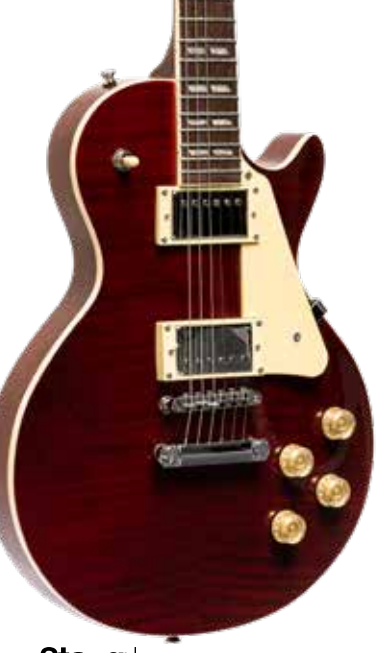
Stagg | SEL DLX W RED