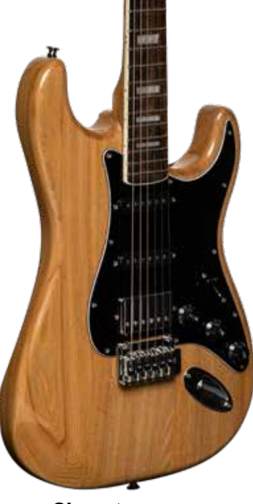
Stagg | SES-60 NAT